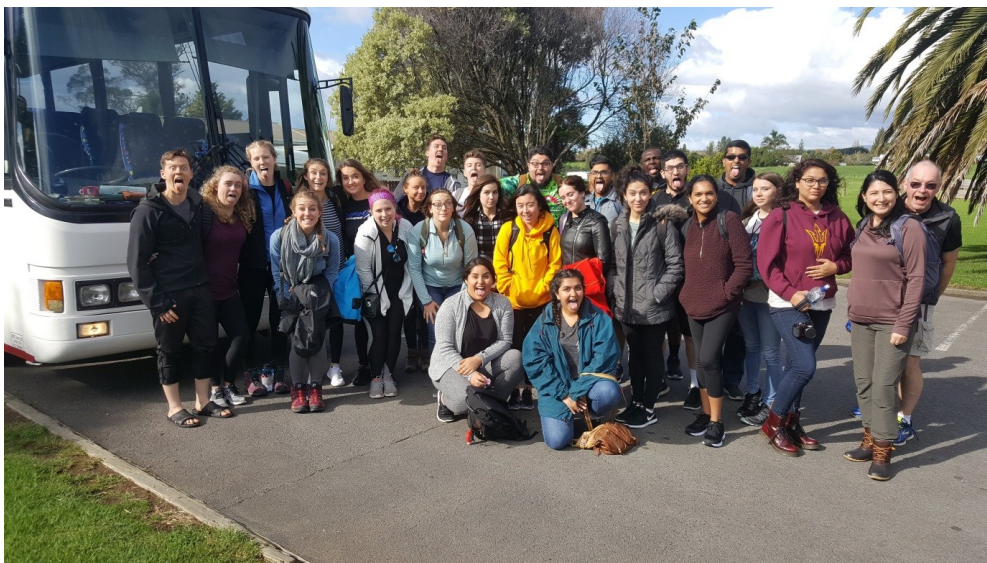
The Kuaka Roopu ready to hit the road

It was great sharing opportunity that allowed an exchange of cultural views relating to health service provision and perspectives on Kaitiakitanga.