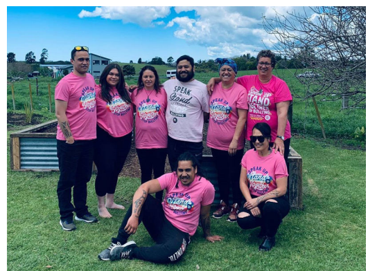
Anti-bullying campaign—Pink shirt day.