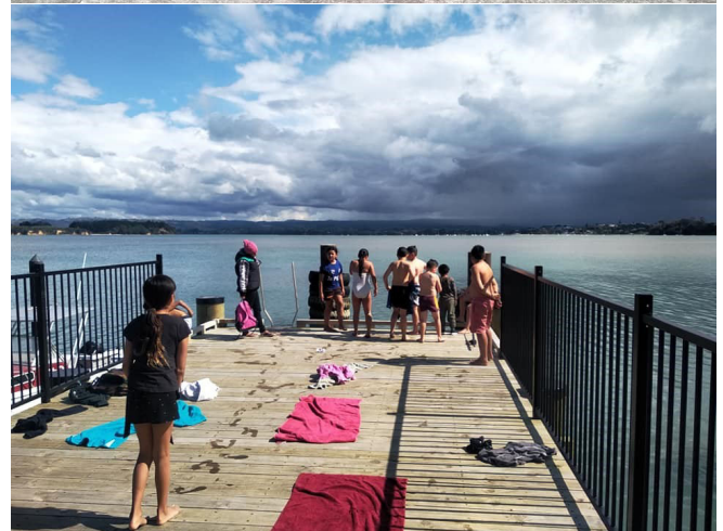
Tu Pou Tahī