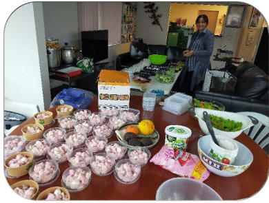
Prepping Wednesday kaumatua kai