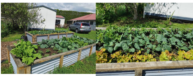
Our Gardens looking great.