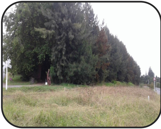
Te Oturu Oranga before Rongoa Planting Project. March 2019