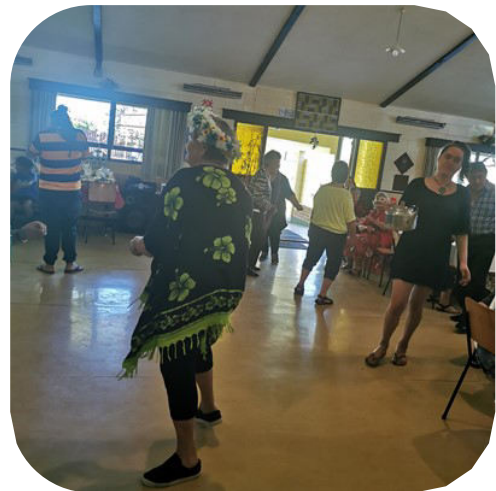
Enjoying the entertainment