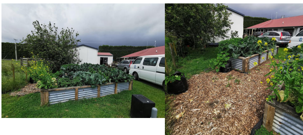
What they look like now!!