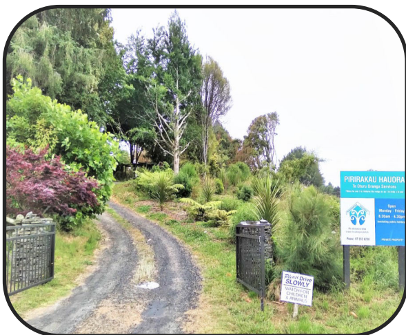
Te Oturu Oranga Rongoa Plantings at the moment. November 2020