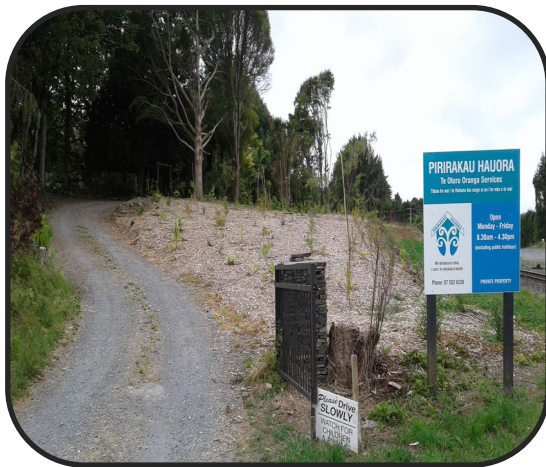
Te Oturu Oranga entrance after Rongoa Planting day. August 2019